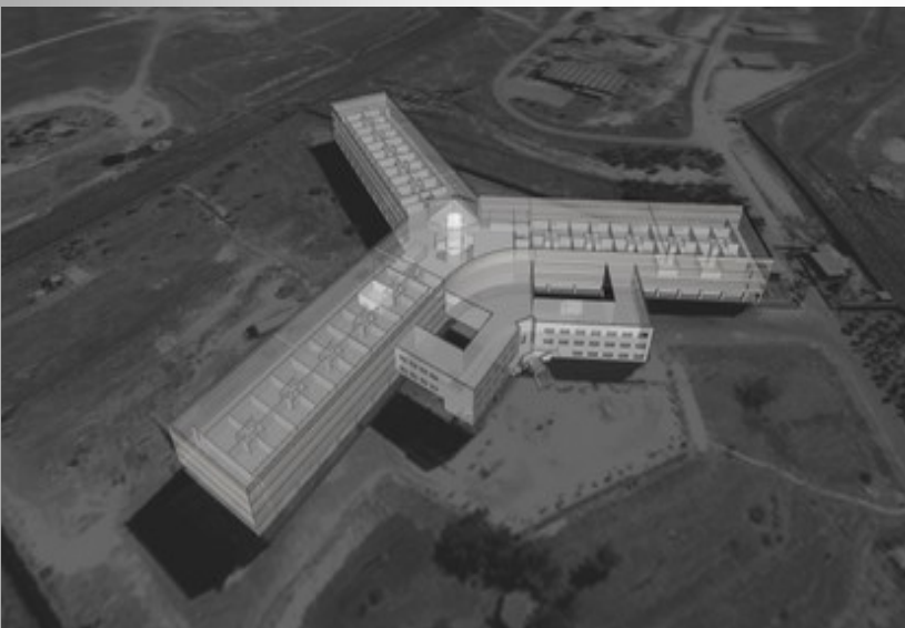
Saydnaya Prison.

This is part of a nationwide campaign being run by Amnesty International.